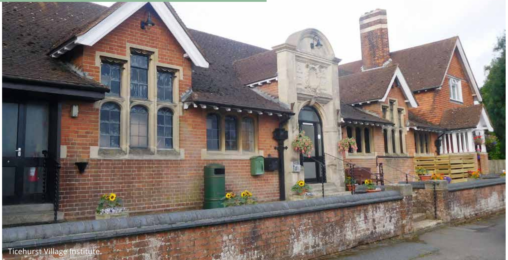
Ticehurst Village Institute.