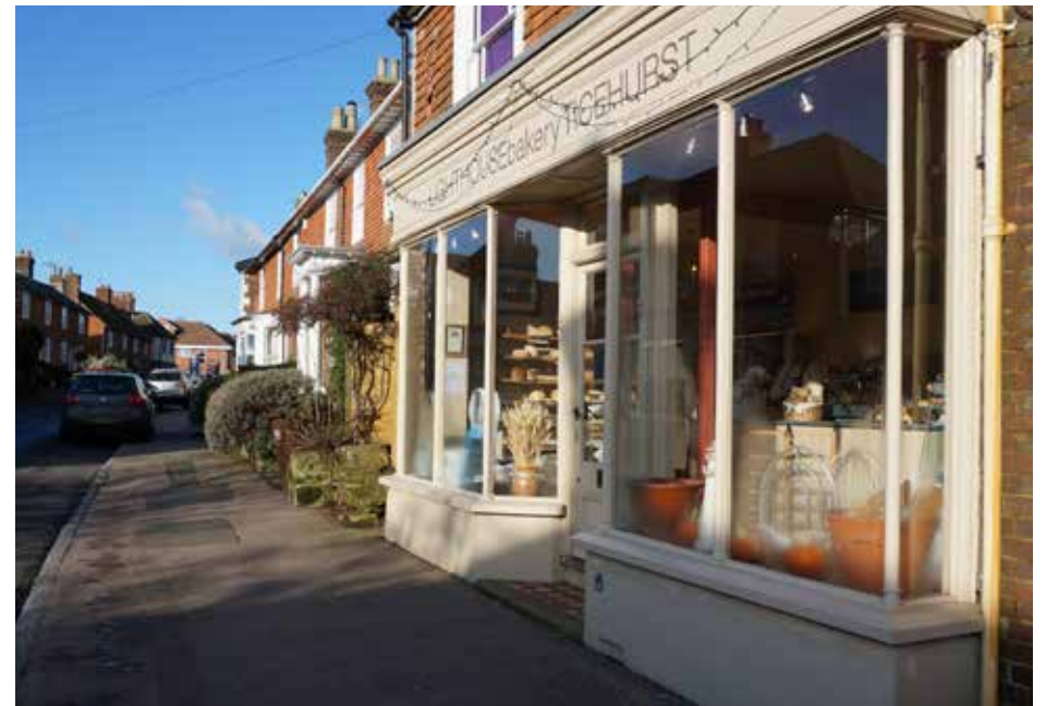
Ticehurst High Street.

2.9 Ticehurst has gradually evolved to become an important centre for the surrounding area. It was identified by Rother District Council along with Robertsbridge as a "rural service centre" with a varied range of shops and businesses, a children's centre, pre-school nursery, a modern primary school, doctors' surgery and post office.