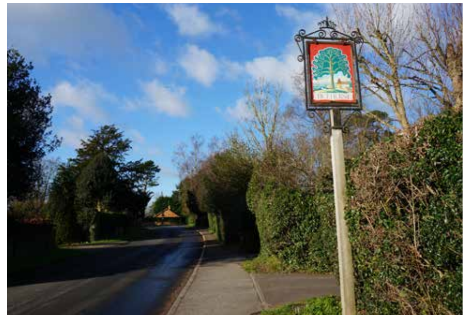
Welcome to Ticehurst.

2.4 With the benefit of modern technology, more people are also working from home and the unemployment rate in the parish is low (2.2% in 2011 census).