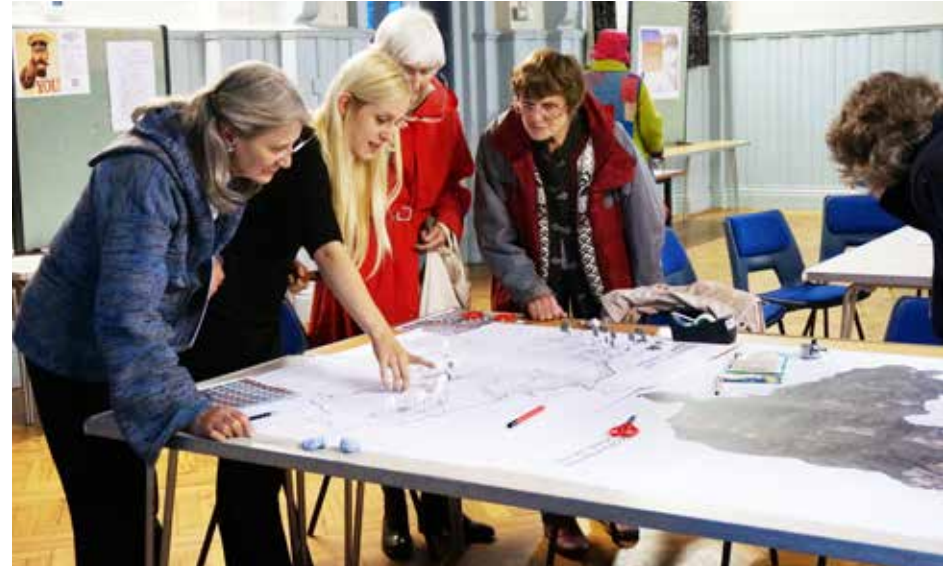
Photographs from the various consultation events held during 2016.